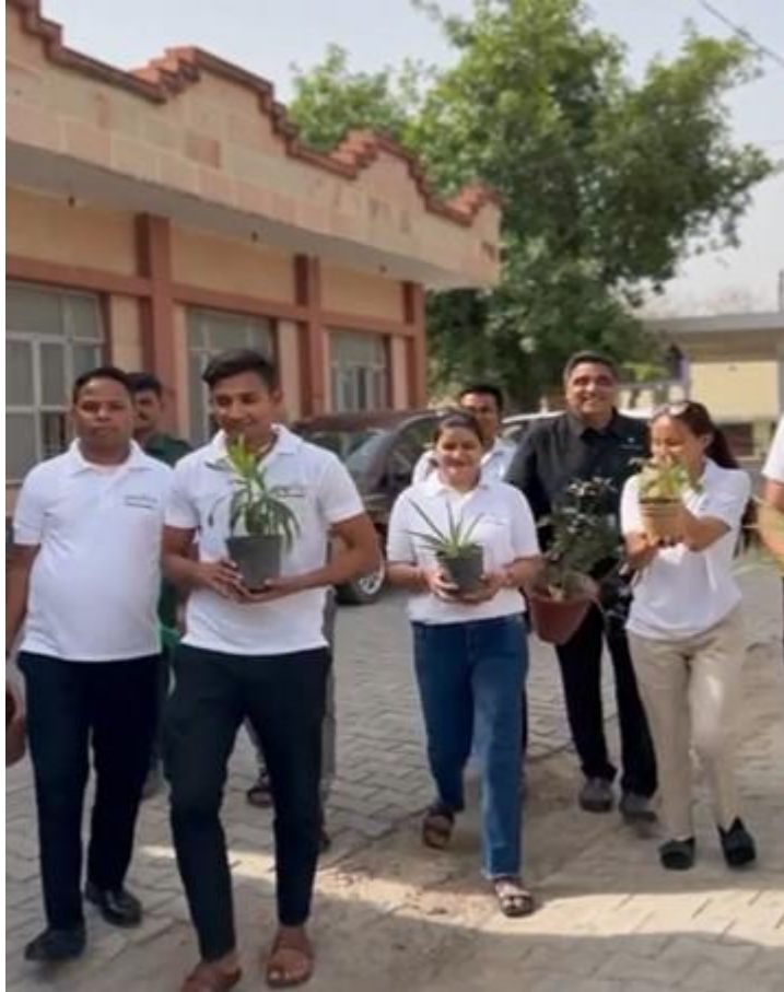
Plantation Drive walk